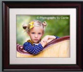
Framed Photographic Print