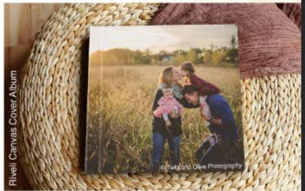
Riveli Canvas Cover Album

American Color Imaging is celebrating 50 years as the 1 st choice of the imaging professional!