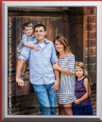
Double Metal Float Frame